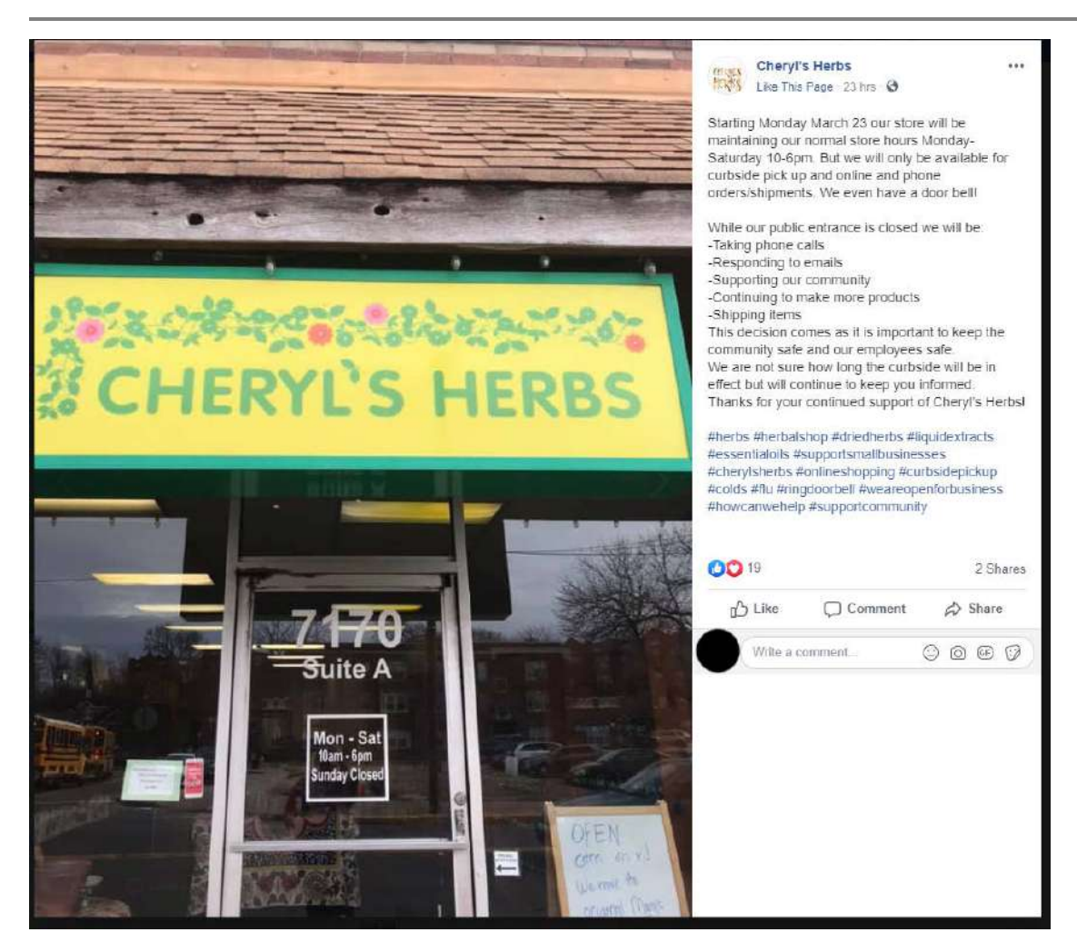
7170 Manchester RD Ste A Maplewood, MO 63143